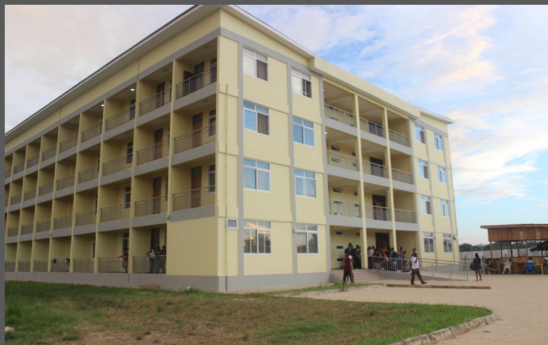
SFUCHAS St. Faustina Hostel