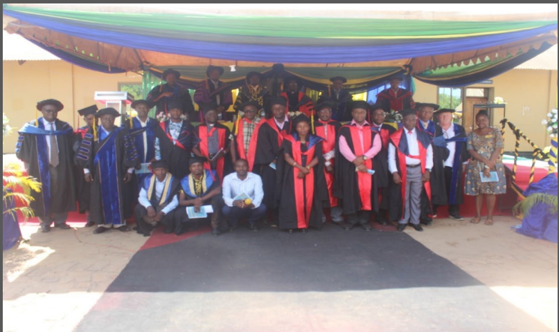
SFUCHAS academic staff during SFUCHAS graduation ceremony.