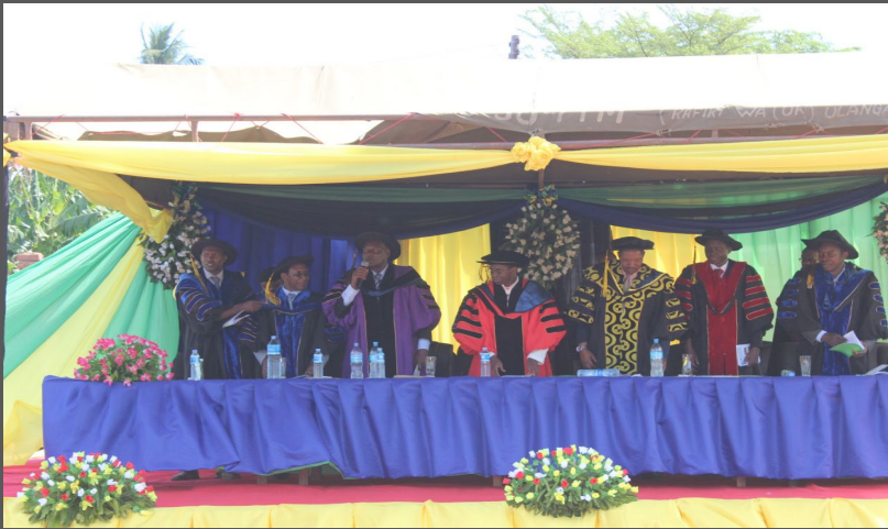
SFUCHAS graduation ceremony at SFUCHAS Graduation Square.