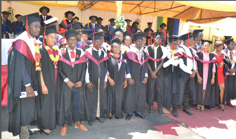
SFUCHAS - MD graduants during graduation ceremony.