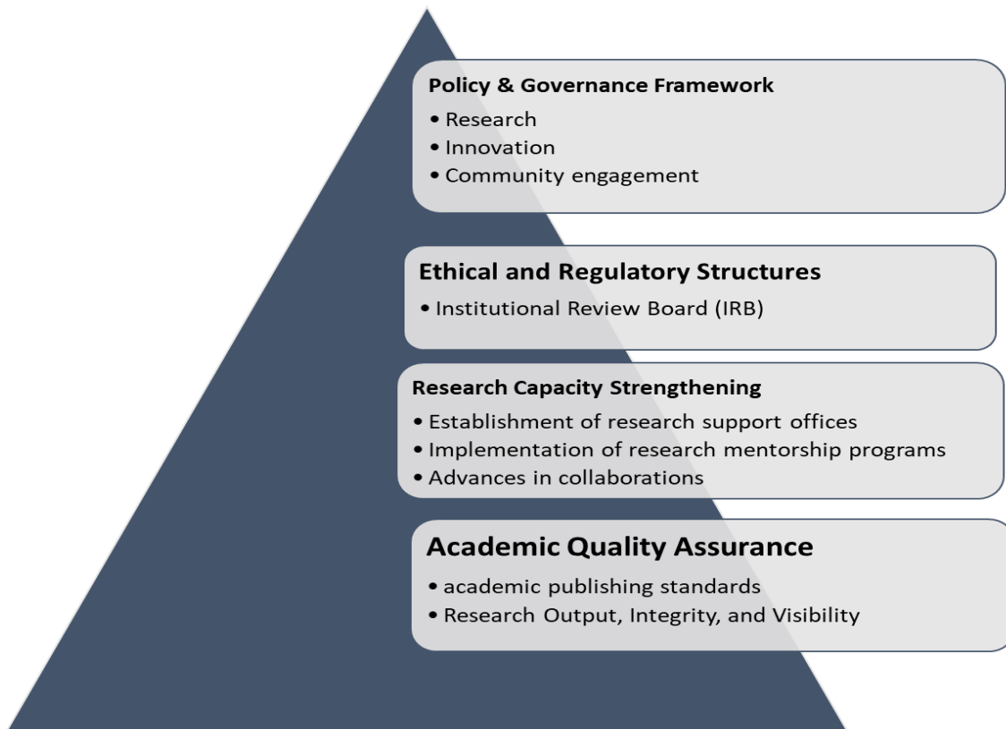
Fig 1: summary of the Key Research, partnership and community services milestones

Figure 1 highlights the summary of key milestones achieved by the SFUCHAS in strengthening its research, partnership, and community engagements for the academic year since Nov 2024 up to date.